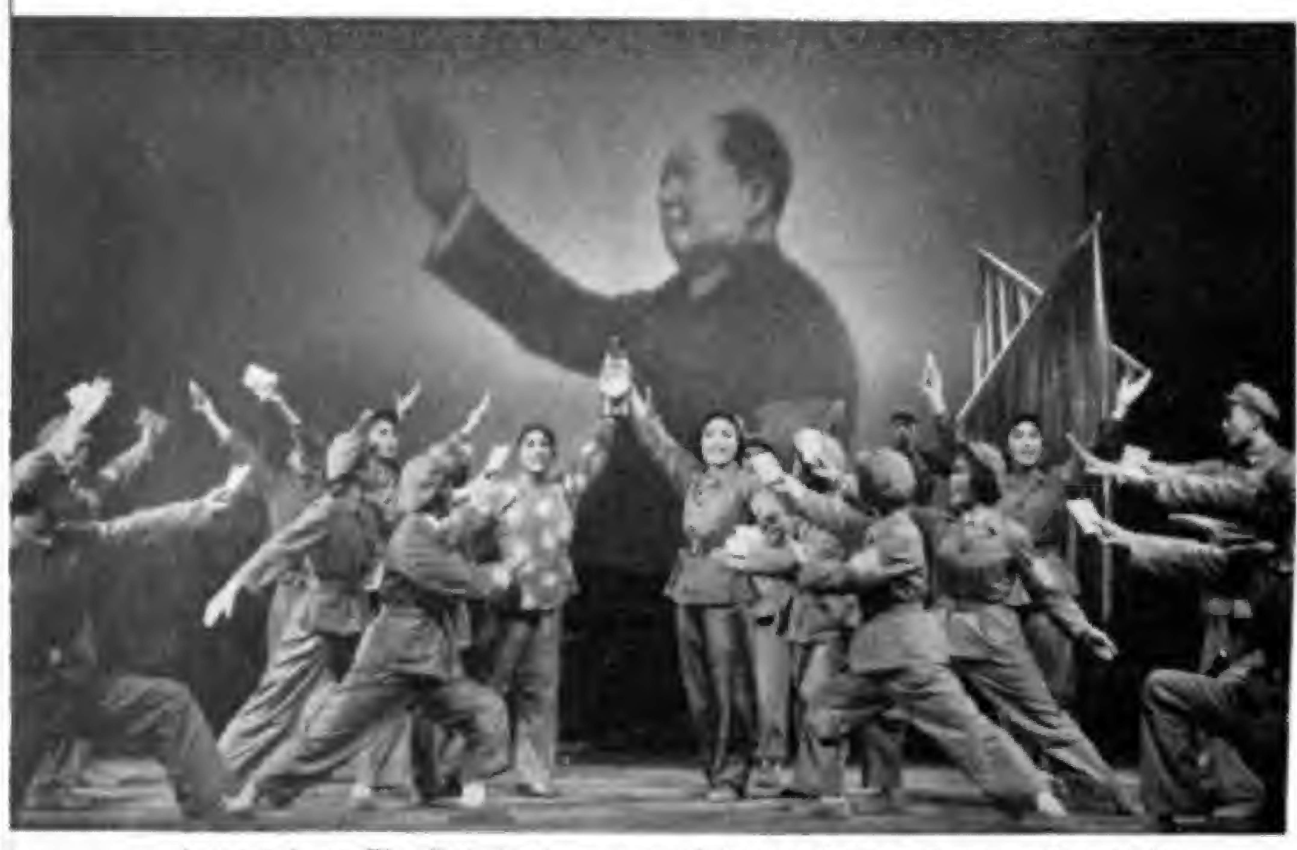
A scene from The Red Lantern, a revolutionary Peking Opera performed by Red Guards. The younger generation take over the red lantern to hold it high forever, carry on the past tradition and open up the way for those who follow.

Their artistic creations are the products of class struggle, the struggle for production and scientific experimentation, the crystallization of the labour of workers, peasants and soldiers, and are in turn the weapons for pushing